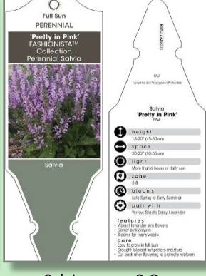
Salvia, zones 3-8