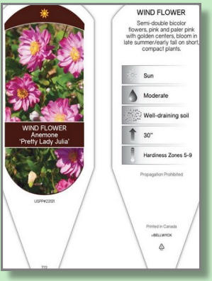
Wind flower, zones 5-9