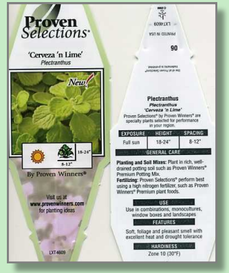
Spurflower, zone 10

As a perennial, which of these plants would you choose for YOUR landscape?